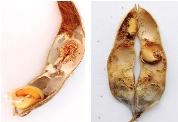
Fig. 1. Soybean pods damaged by Leguminivora glycinivorella Mats. (photo by the author).

Annually soybean seeds in Primorsky kray are damaged by the soybean pod borer Leguminivora glycinivorella Mats. (Lepidoptera, Tortricidae) – a common soybean pest in the Russian Far East – [3-4] (Figure 1). The soybean pod borer is widely spread in Khabarovskiy and Primorsky kray, Amur oblast, the Northeast China, Korea, and Japan [5, 6]. The soybean seeds damaged by this pest might lose up to 30% of their weight and have a significantly reduced content of oil. According to T.K. Kovalenko and A.V. Lukashenko, the average degree of the damage caused by the soybean pod borer is 8.3 % at the stage of maturity [7]. Larvae of Leguminivora glycinivorella Mats. might damage from 70 to 100 % of soybean fields at the stage of seed maturing under the conditions of Khabarovskiy kray in particular years [8].