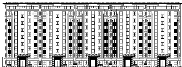
Fig. 2. Elevation of cast-in-place building and prefabricated Building.