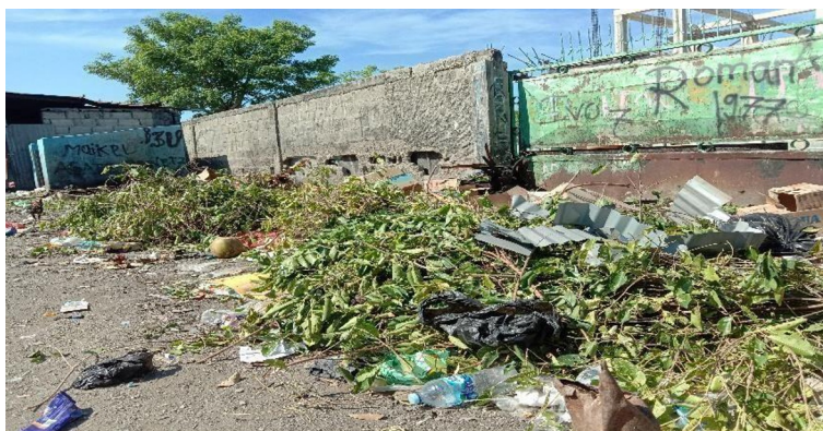
Fig. 3. One of the waste disposal activities is not in place.

Based on field observation data in the research area, it was found that the practice of indiscriminate waste disposal. We often find local residents throwing garbage in the wrong place (see Fig. 3). In addition to this phenomenon, waste disposal is not previously sorted according to the type of waste (Fig. 2). In addition to the budget implementation process that is not right on target, regulatory aspects are still a big obstacle to managing waste management.