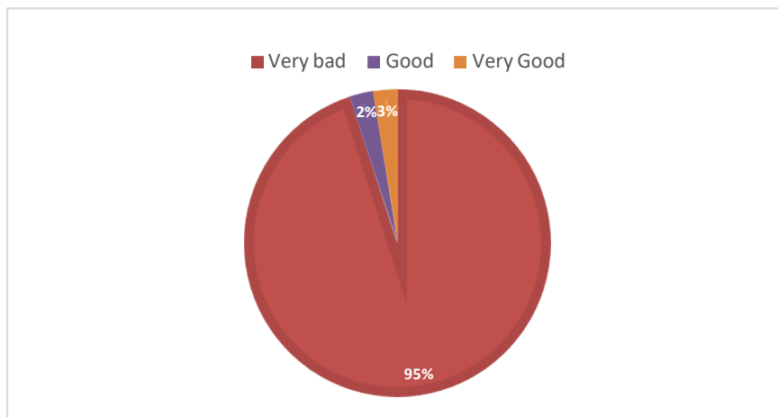
Fig. 4. Up-to-date waste regulation from the government so far.