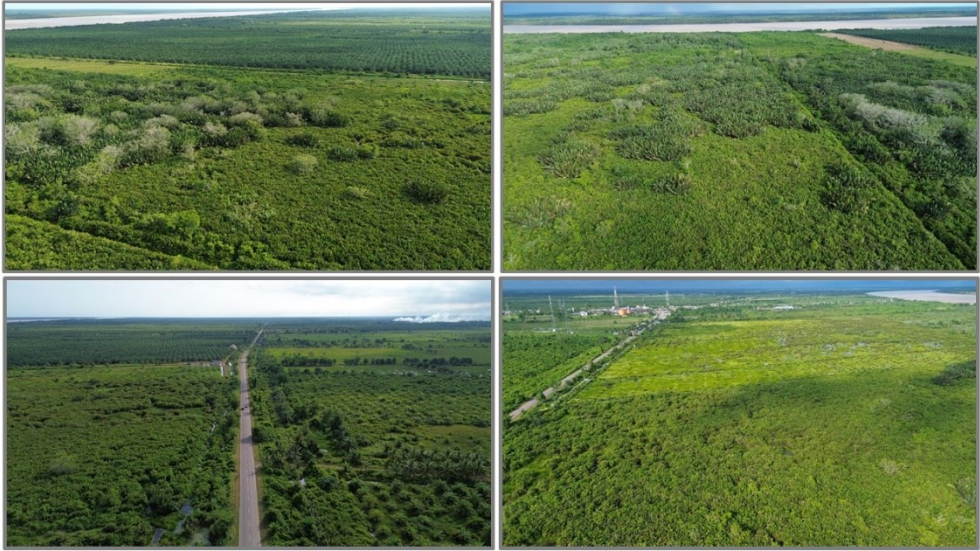
Fig. 3. Aerial photo of the distribution of three IAS species ( N. fruticans , A. aureum , and D. trifoliata ) in ATPF. All three are associated with each other and with other plants.