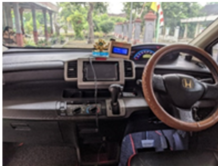
Fig. 2. Illustration of device installation on car dashboard

The physical device installation on the car dashboard is shown in Fig. 2 . Comprehensive testing of the intelligent GPS-based speed monitoring system demonstrated exceptional performance across all evaluated parameters, with results exceeding initial design specifications and comparing favorably with commercial alternatives costing significantly more. GPS accuracy validation revealed outstanding precision in speed measurement applications, with the Ublox NEO 6M module achieving 98.98% accuracy across all tested speed ranges.